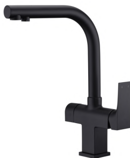
SORA Black matte