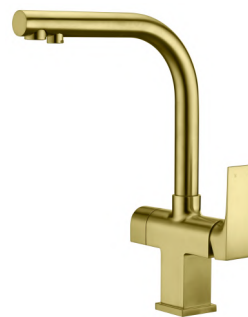
SORA Antique brass