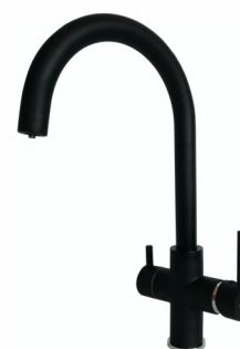
BERG Black matte - 4-way faucet