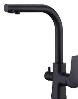
TIVOLI Black matte