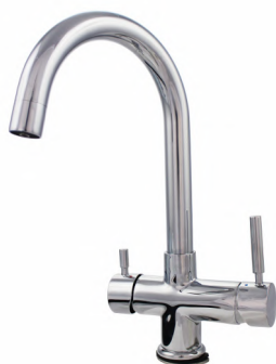
4YOU Chrome - 4-way faucet