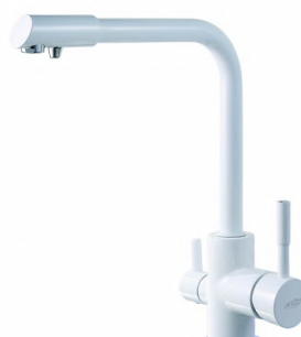
AMANDA White gloss