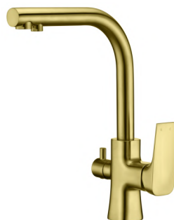
TIVOLI Antique brass