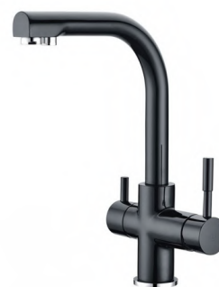
ALABAMA 44 Black metallic