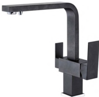
TAUPO Black metallic