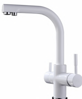
ALABAMA White gloss