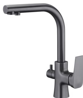
TIVOLI Graphite - gun metal