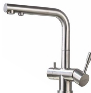
ZARA Inox STAINLESS STEEL