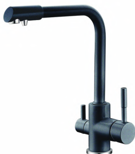
AMANDA 44 Black metallic