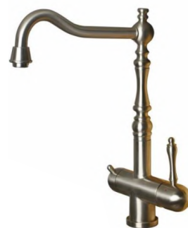
PLATINA Inox STAINLESS STEEL