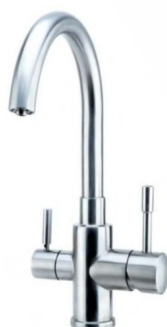
PALMIRA Inox STAINLESS STEEL